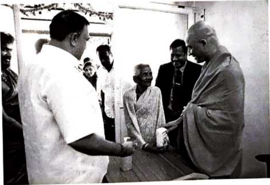
Professor & HOD Department of Community Medicine