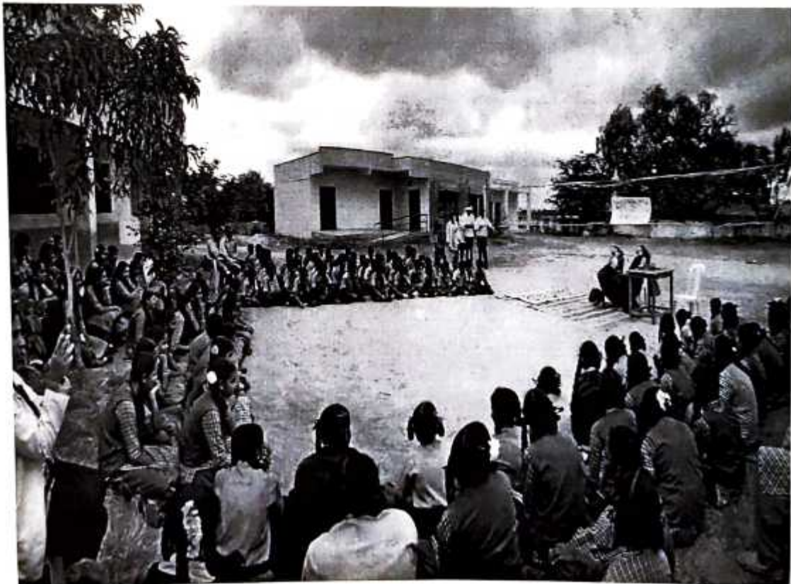
Professor & HOD Department of Community Medicine