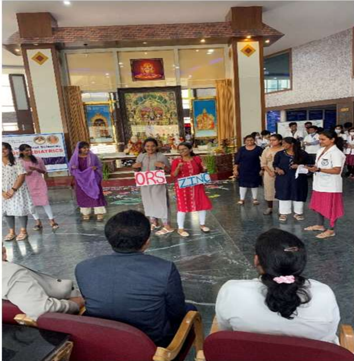
Skit by students