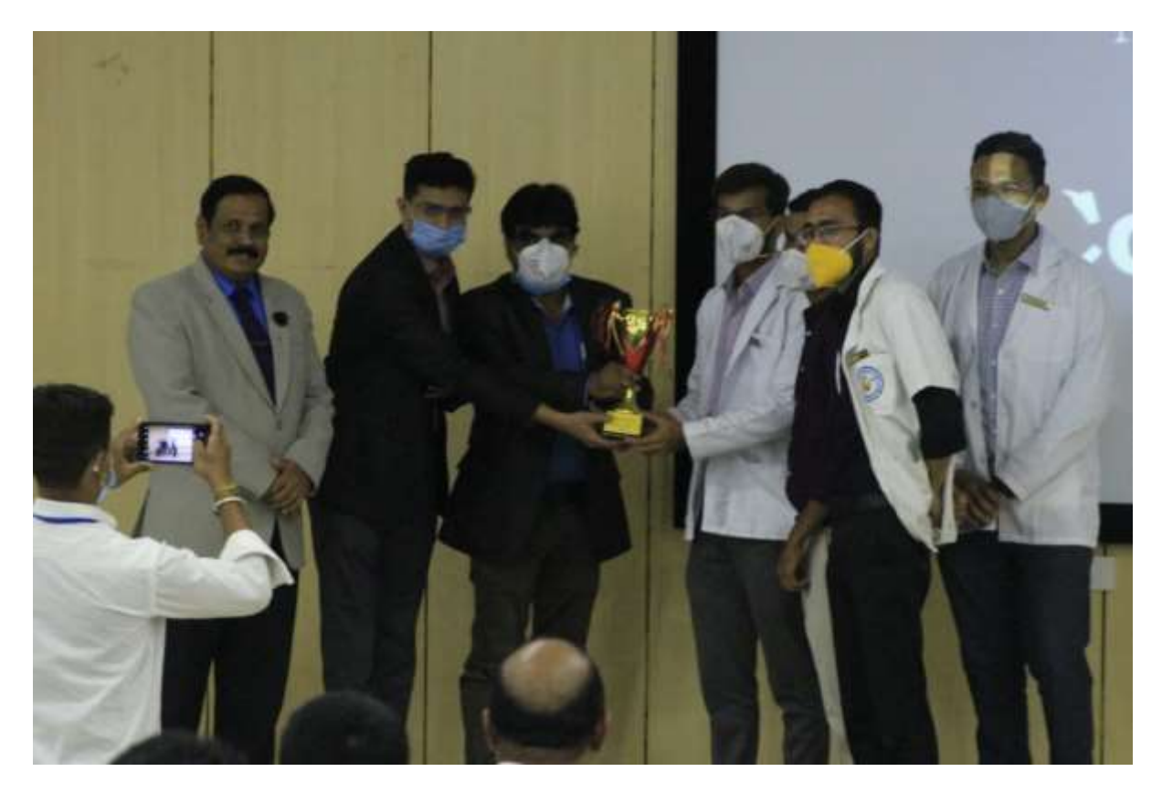
Runners up trophy for the Student Team