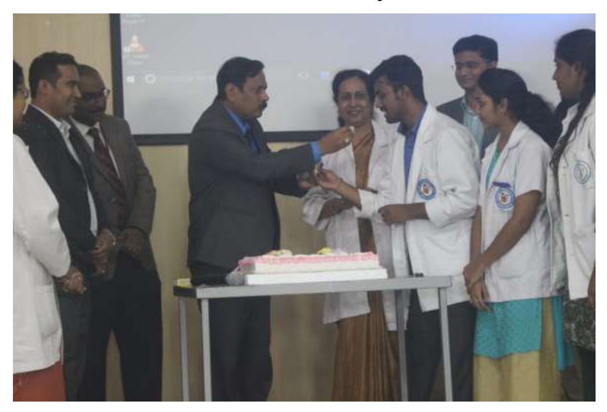
Cake Cutting by the Principal on Occasion of Teachers day