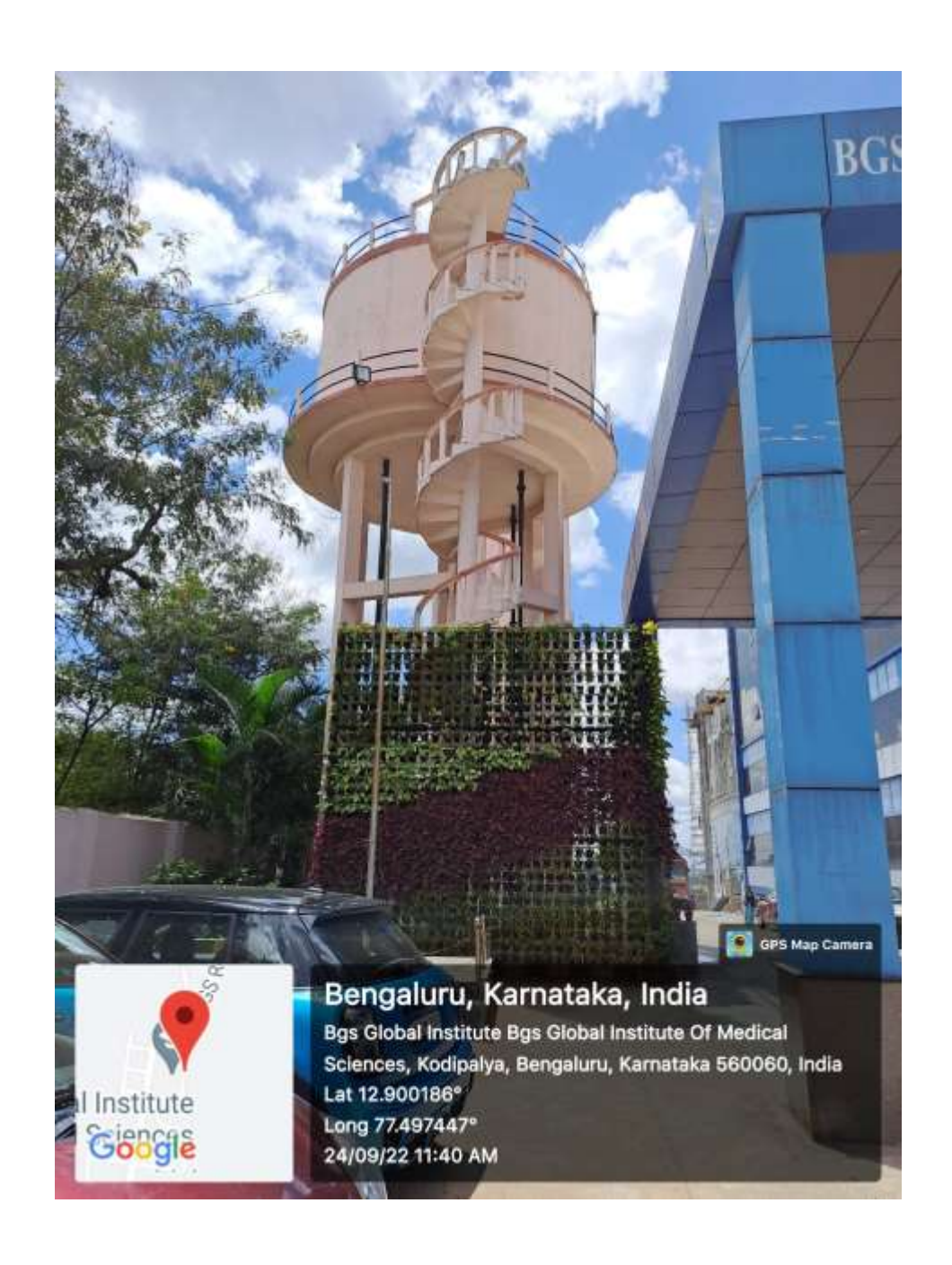
Water Tank and Distribution