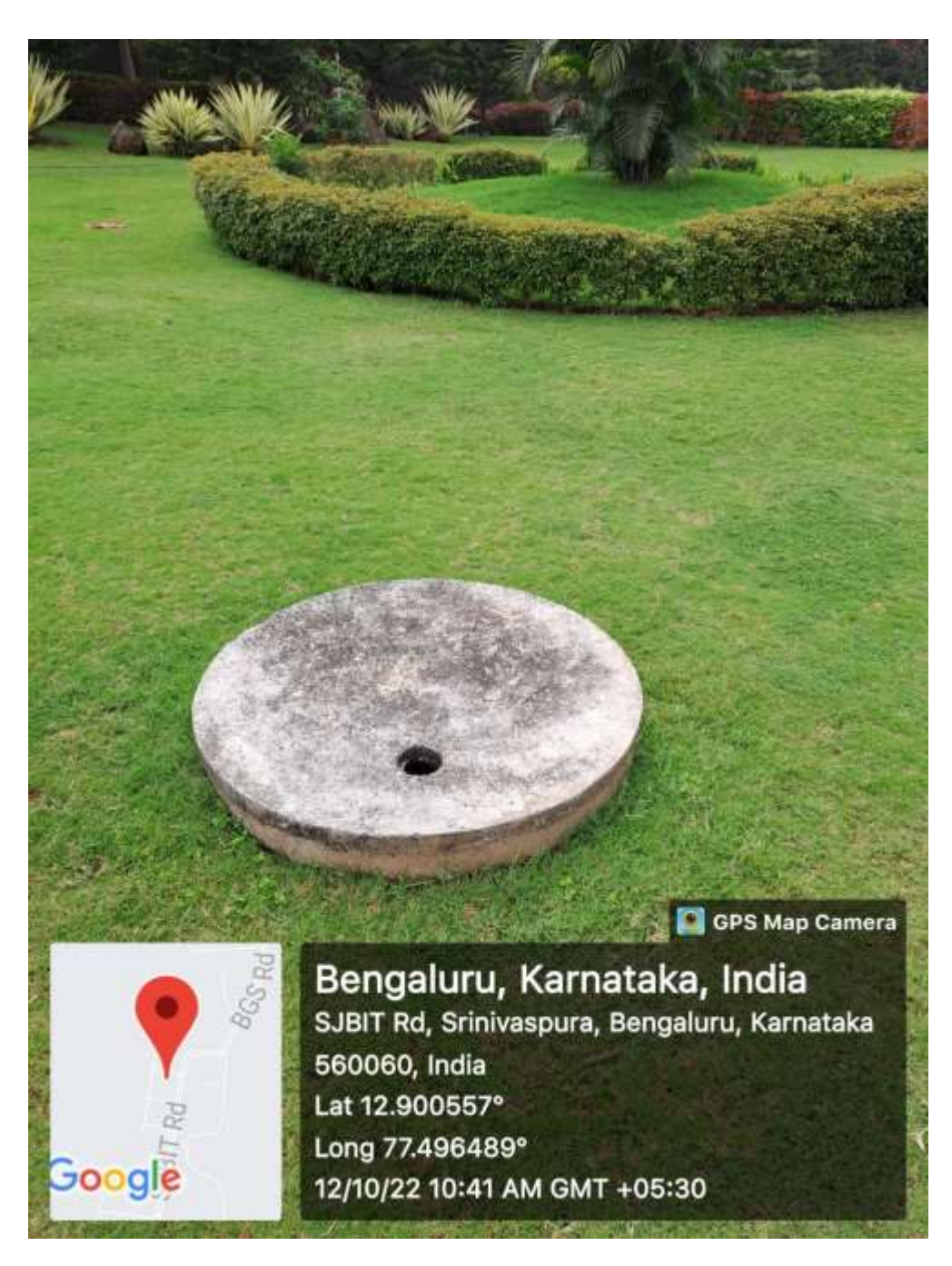
Bore well Recharge