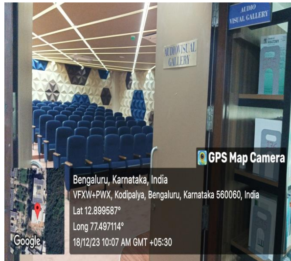
A V ROOM