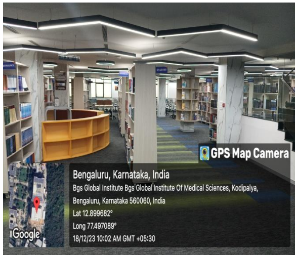
U.G. READING AREA