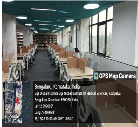
P.G. READING AREA