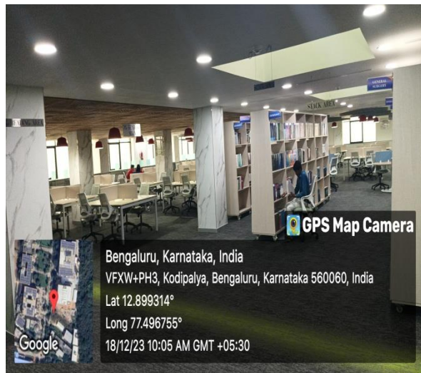
STAFF READING AREA