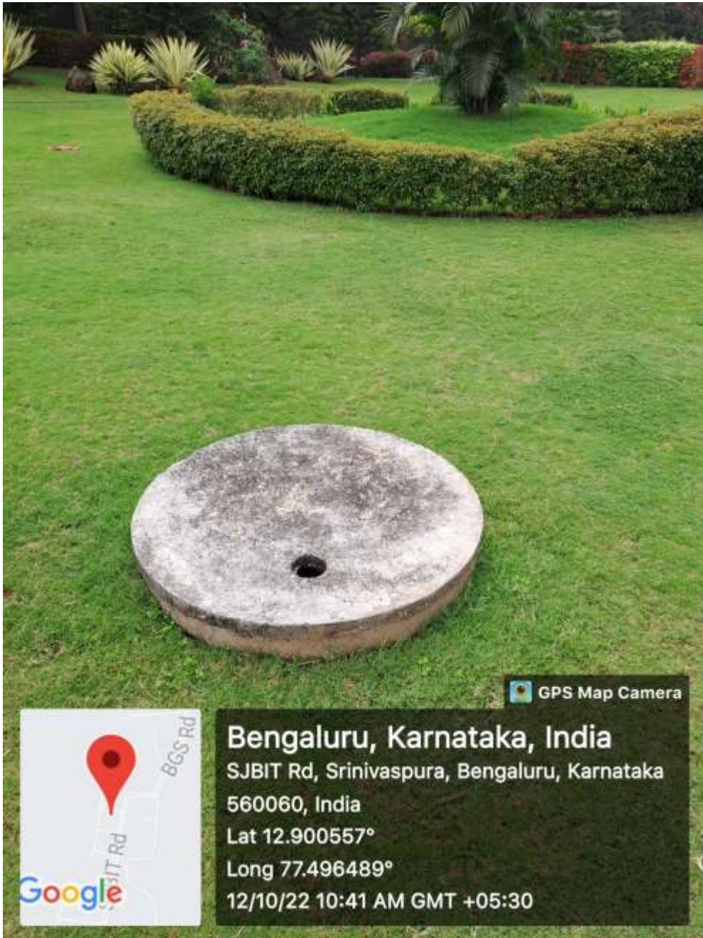
Bore well Recharge